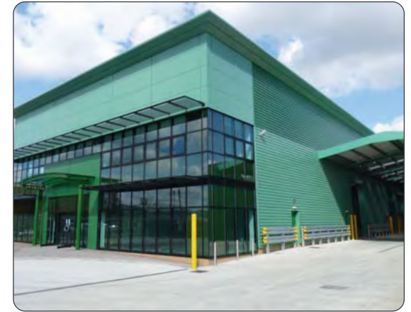
Phase I offices