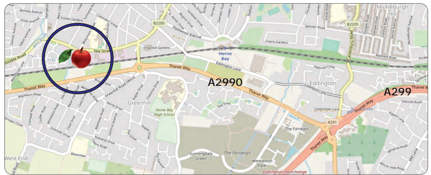
These particulars are provided in good faith but do not form part of a contract. No statements are to be relied upon as statements of fact and parties intending to rely upon the information for any purpose whatsoever must satisfy themselves by inspection or otherwise as to the correctness of each statement.