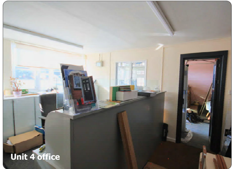
Unit 4 office