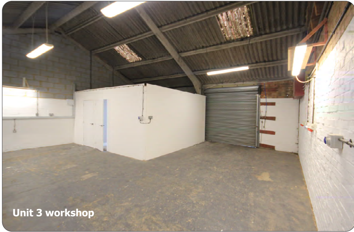
Unit 3 workshop