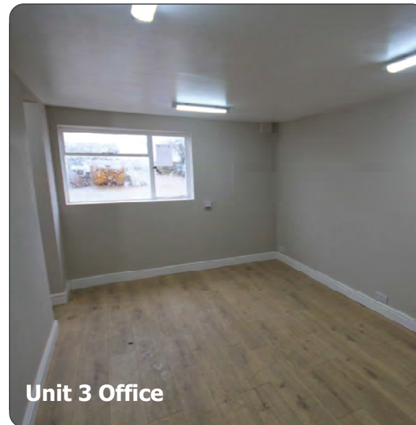
Unit 3 Office