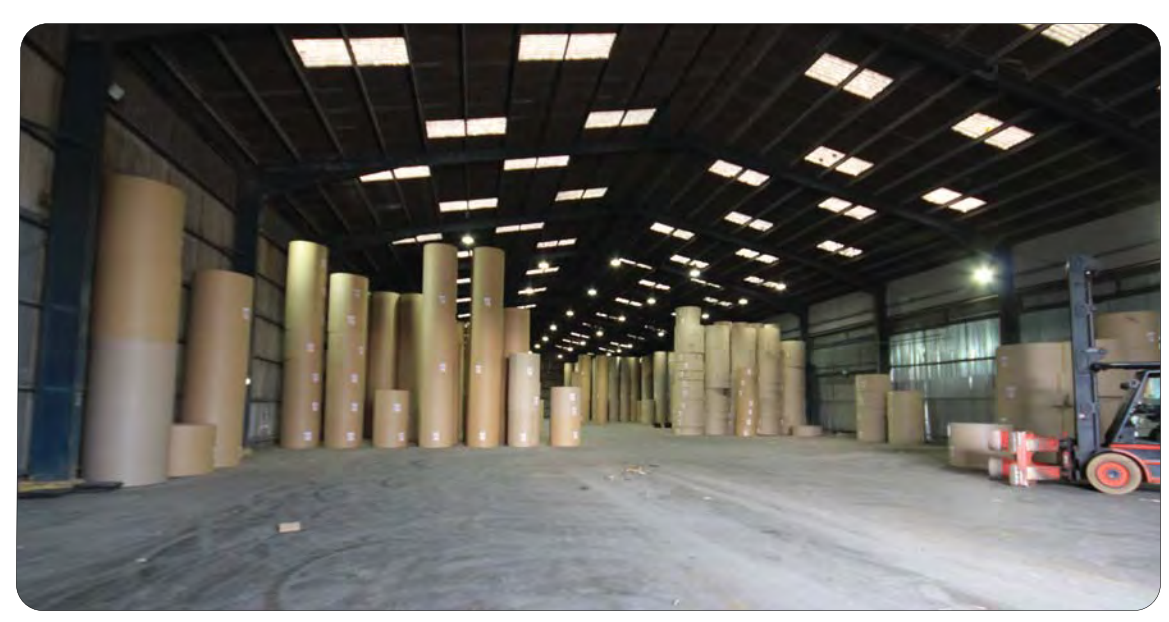
These particulars are provided in good faith but do not form part of a contract. No statements are to be relied upon as statements of fact and parties intending to rely upon the information for any purpose whatsoever must satisfy themselves by inspection or otherwise as to the correctness of each statement.