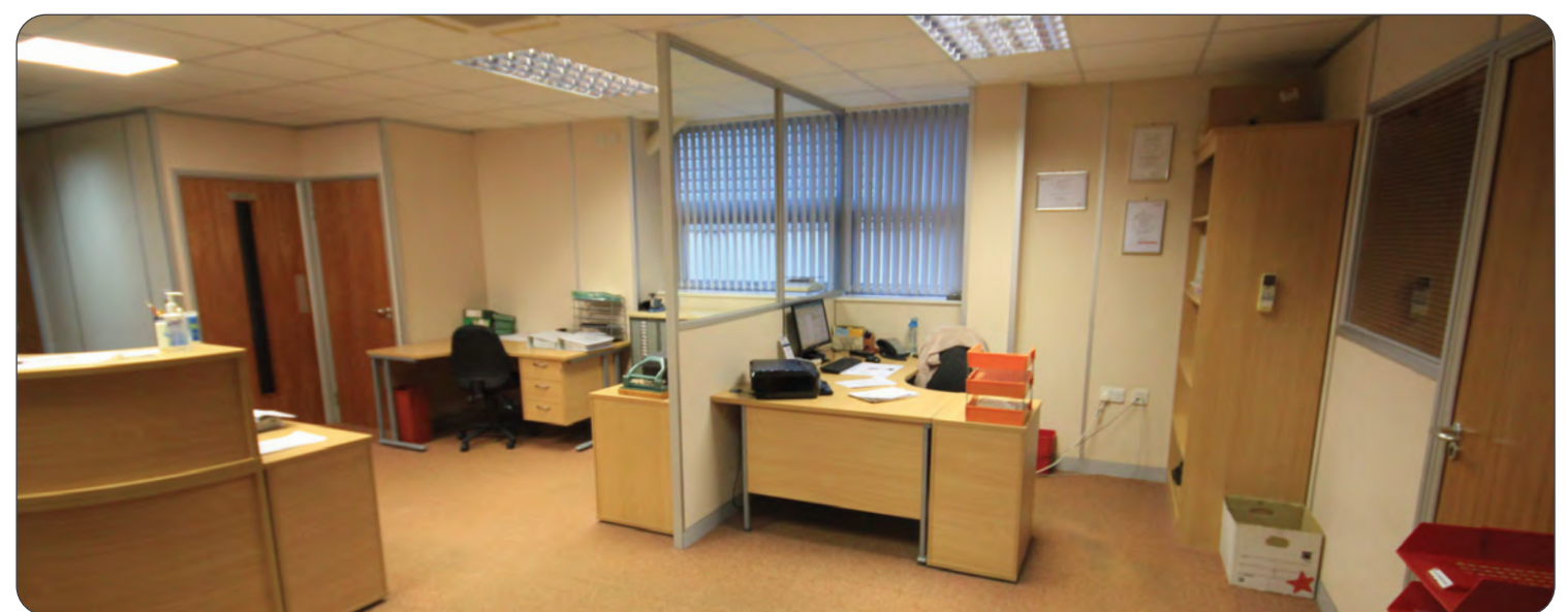
These particulars are provided in good faith but do not form part of a contract. No statements are to be relied upon as statements of fact and parties intending to rely upon the information for any purpose whatsoever must satisfy themselves by inspection or otherwise as to the correctness of each statement.