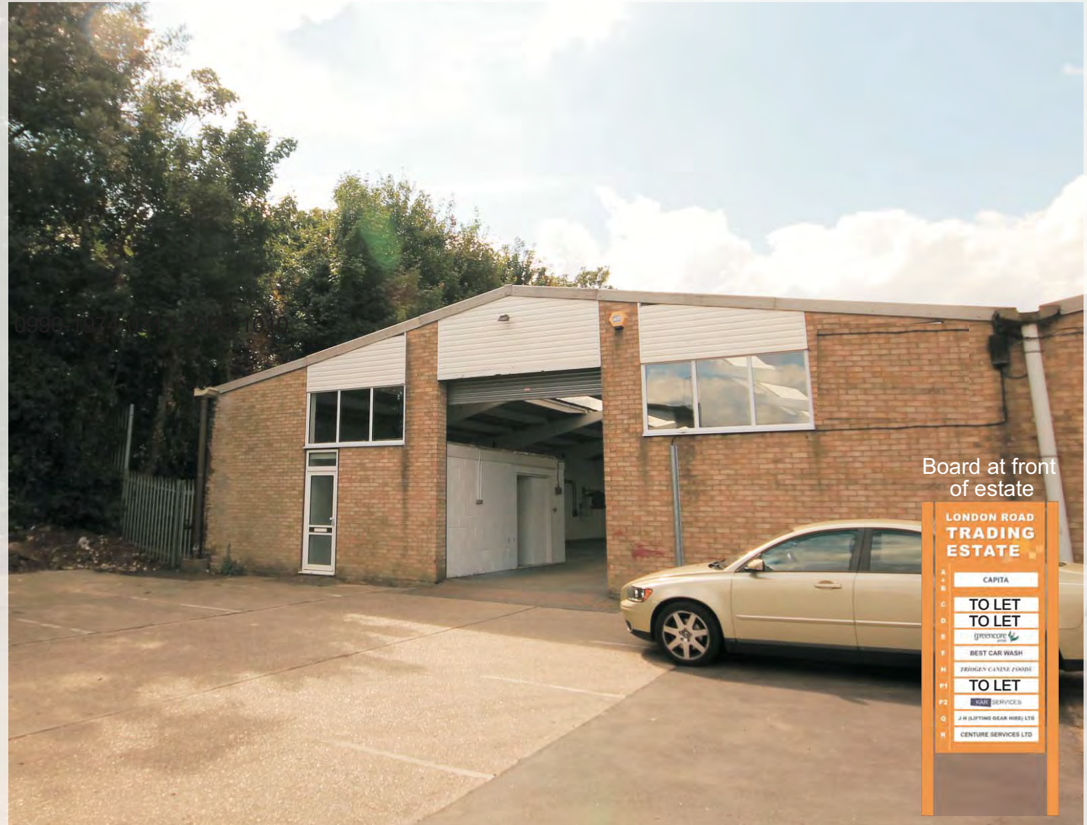
Board at front of estate

To let at £20,000 pa plus vat. Rates payable year 2013/14: £10,362 pa (Rateable Value £22,000).