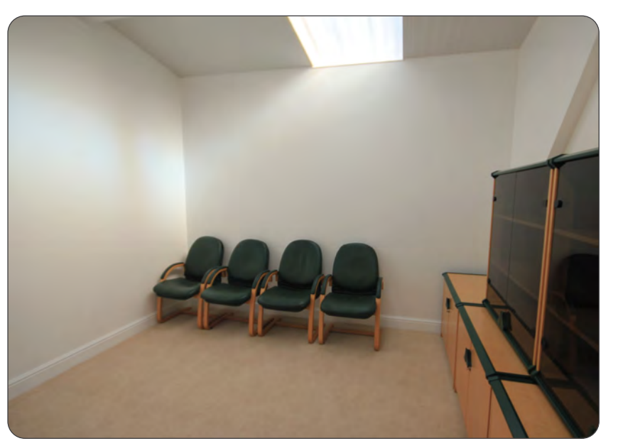
These particulars are provided in good faith but do not form part of a contract. No statements are to be relied upon as statements of fact and parties intending to rely upon the information for any purpose whatsoever must satisfy themselves by inspection or otherwise as to the correctness of each statement.