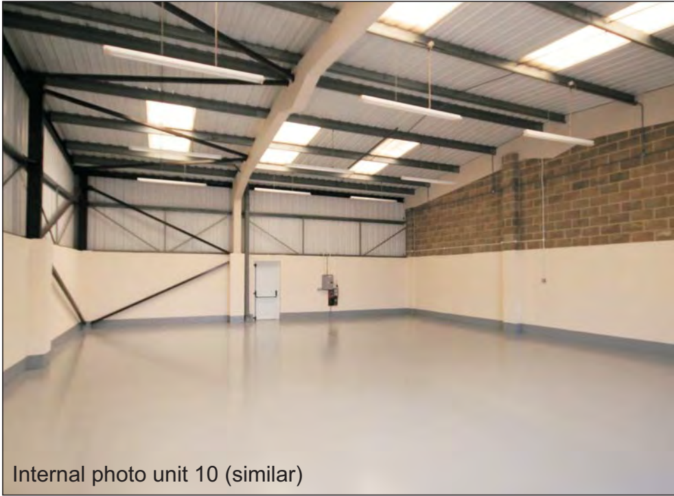
Internal photo unit 10 (similar)