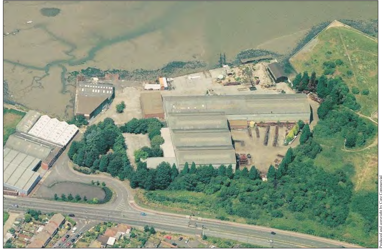
Produced and copyright by Core Commercial