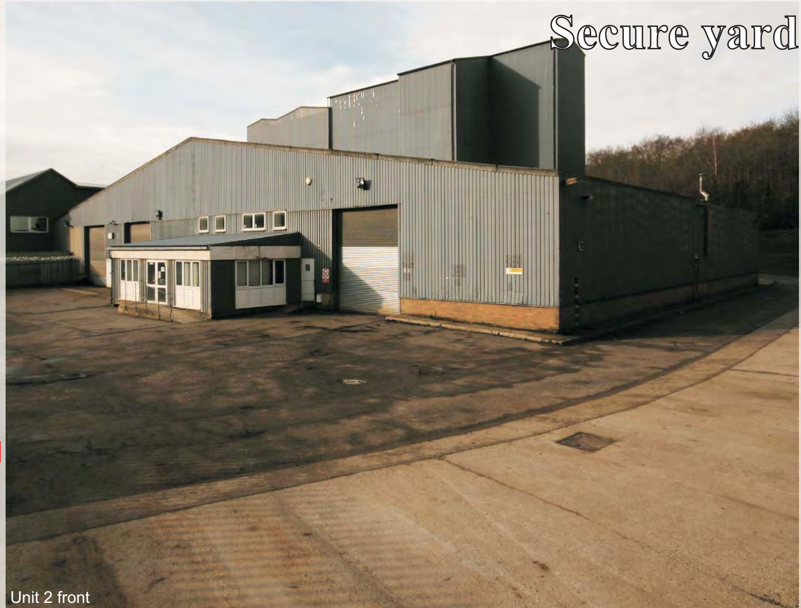
Unit 2 front