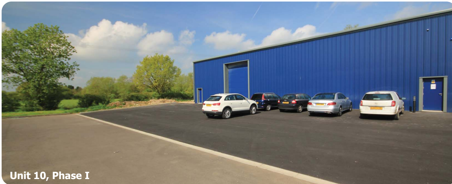
Unit 10, Phase I

These particulars are provided in good faith but do not form part of a contract. No statements are to be relied upon as statements of fact and parties intending to rely upon the information for any purpose whatsoever must satisfy themselves by inspection or otherwise as to the correctness of each statement.