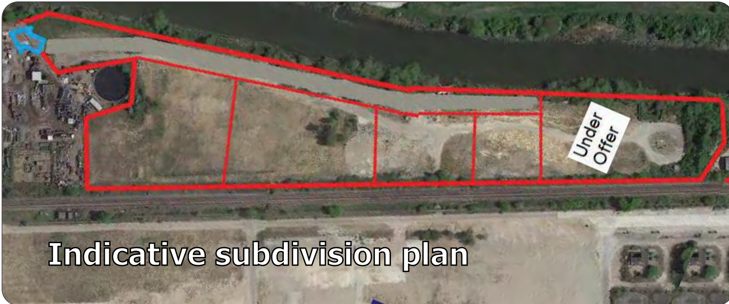
Indicative subdivision plan