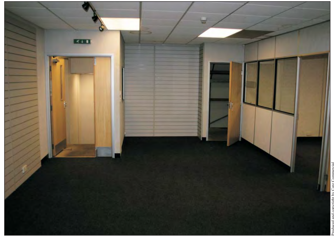
Produced and copyright by Core Commercial