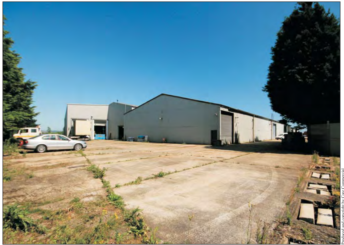
Produced and copyright by Core Commercial