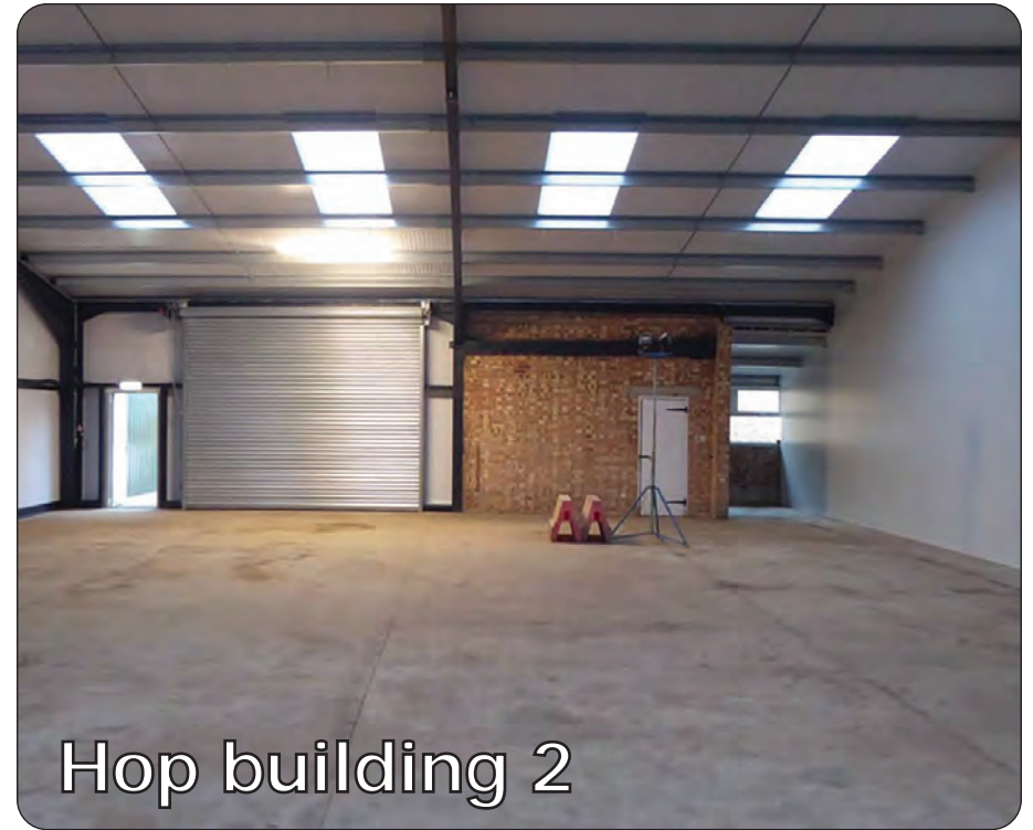
Hop building 2