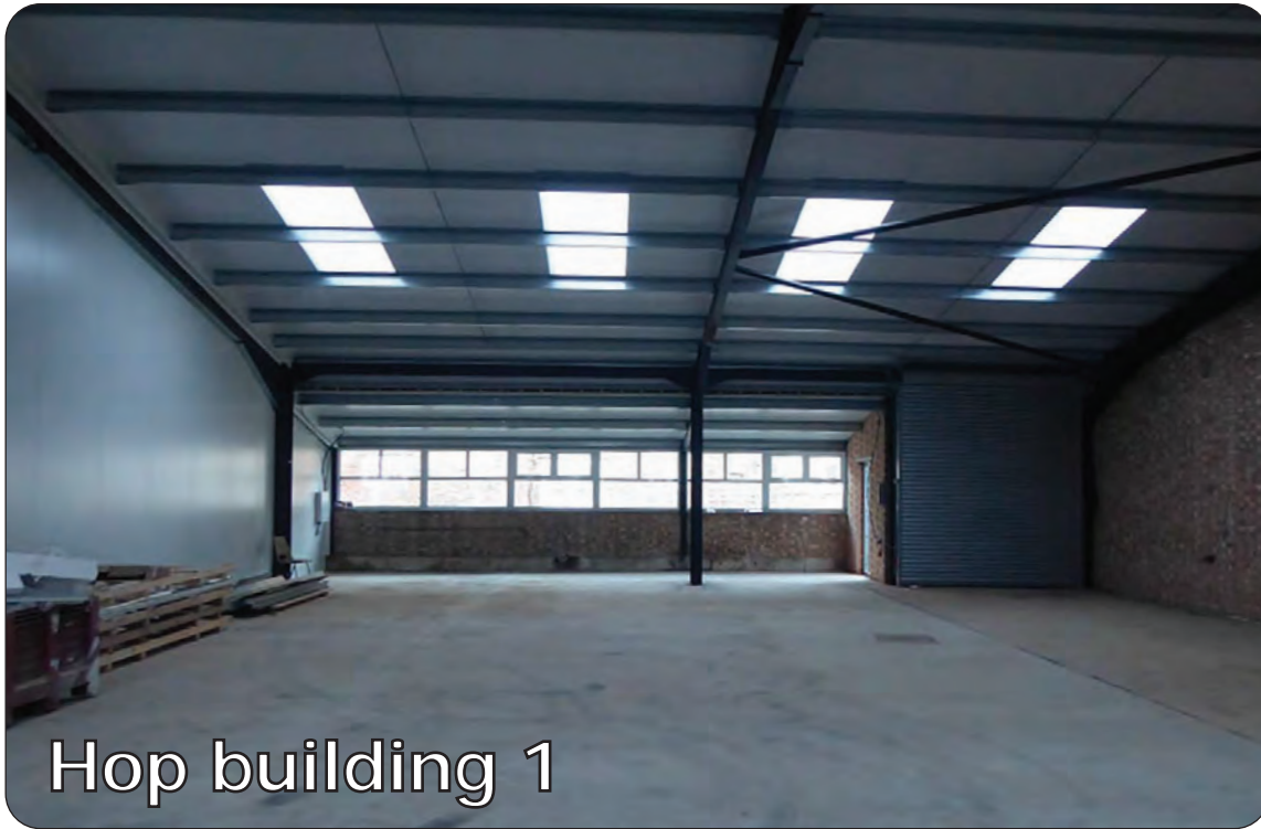
Hop building 1