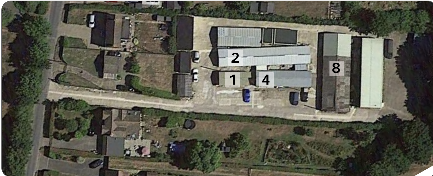
These particulars are provided in good faith but do not form part of a contract. No statements are to be relied upon as statements of fact and parties intending to rely upon the information for any purpose whatsoever must satisfy themselves by inspection or otherwise as to the correctness of each statement.