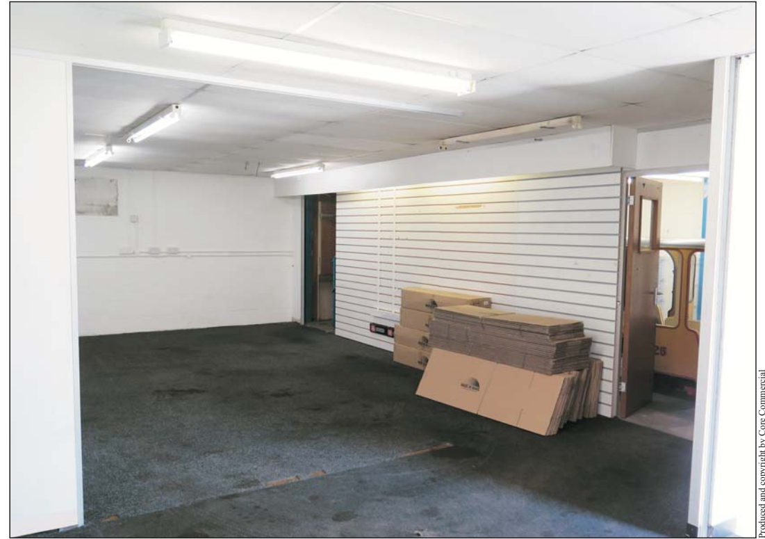
Produced and copyright by Core Commercial