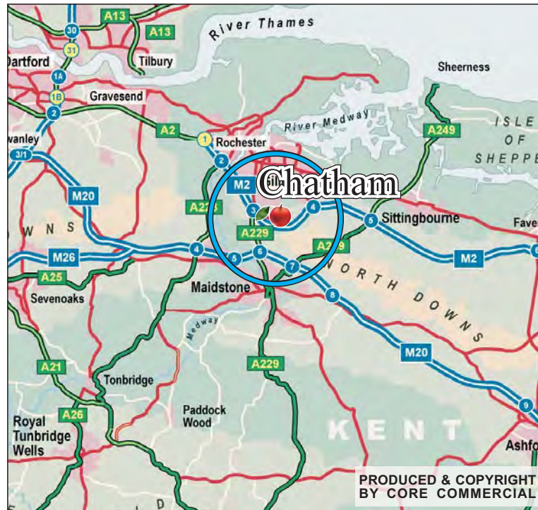
PRODUCED & COPYRIGHT BY CORE COMMERCIAL