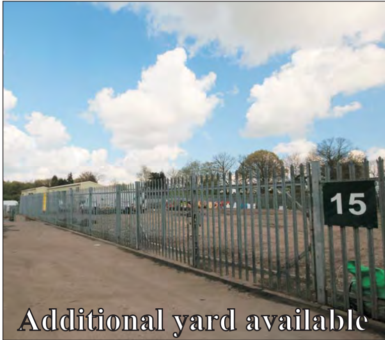
Additional yard available