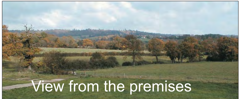
View from the premises

The Old Dairy, Eggpie Lane, Weald SEVENOAKS Kent TN14 6NP