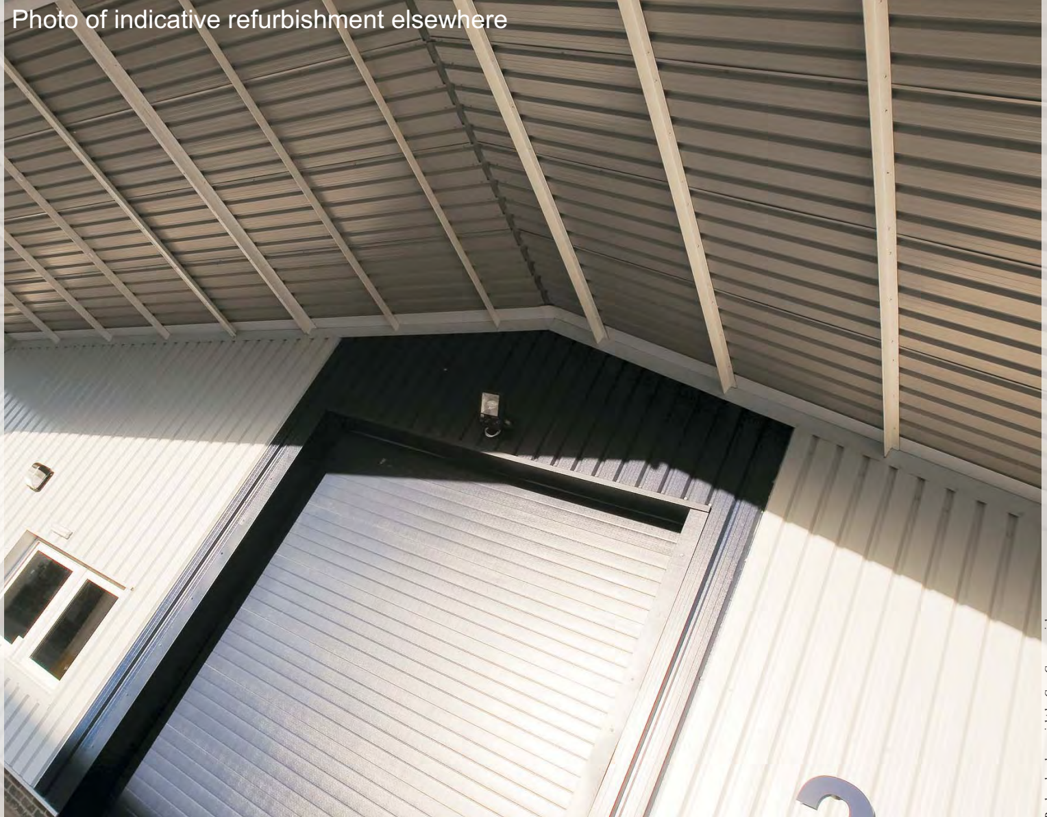
Photo of indicative refurbishment elsewhere

Available freehold as a whole or subdivided. Refurbished or as existing. Attractive terms on application.