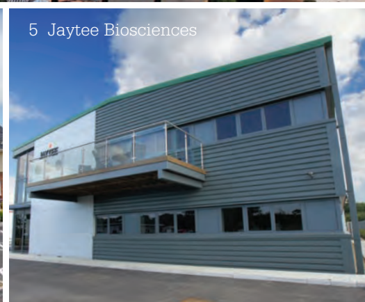
5 Jaytee Biosciences