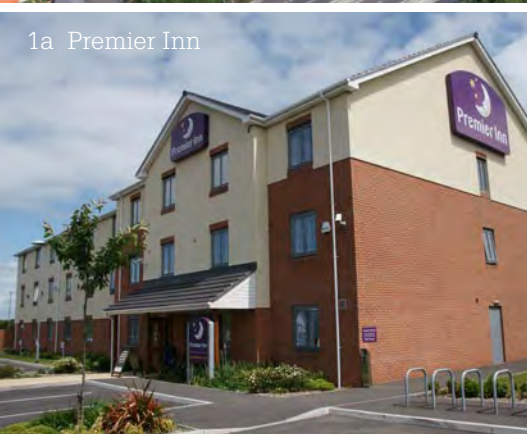
1a Premier Inn