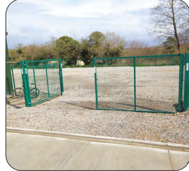
These particulars are provided in good faith but do not form part of a contract. No statements are to be relied upon as statements of fact and parties intending to rely upon the information for any purpose whatsoever must satisfy themselves by inspection or otherwise as to the correctness of each statement.