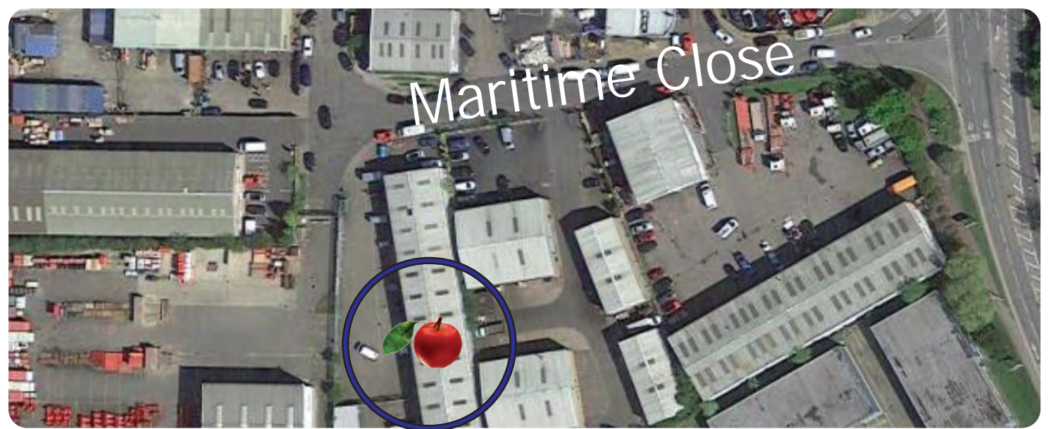
These particulars are provided in good faith but do not form part of a contract. No statements are to be relied upon as statements of fact and parties intending to rely upon the information for any purpose whatsoever must satisfy themselves by inspection or otherwise as to the correctness of each statement.