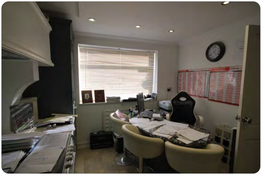
These particulars are provided in good faith but do not form part of a contract. No statements are to be relied upon as statements of fact and parties intending to rely upon the information for any purpose whatsoever must satisfy themselves by inspection or otherwise as to the correctness of each statement.