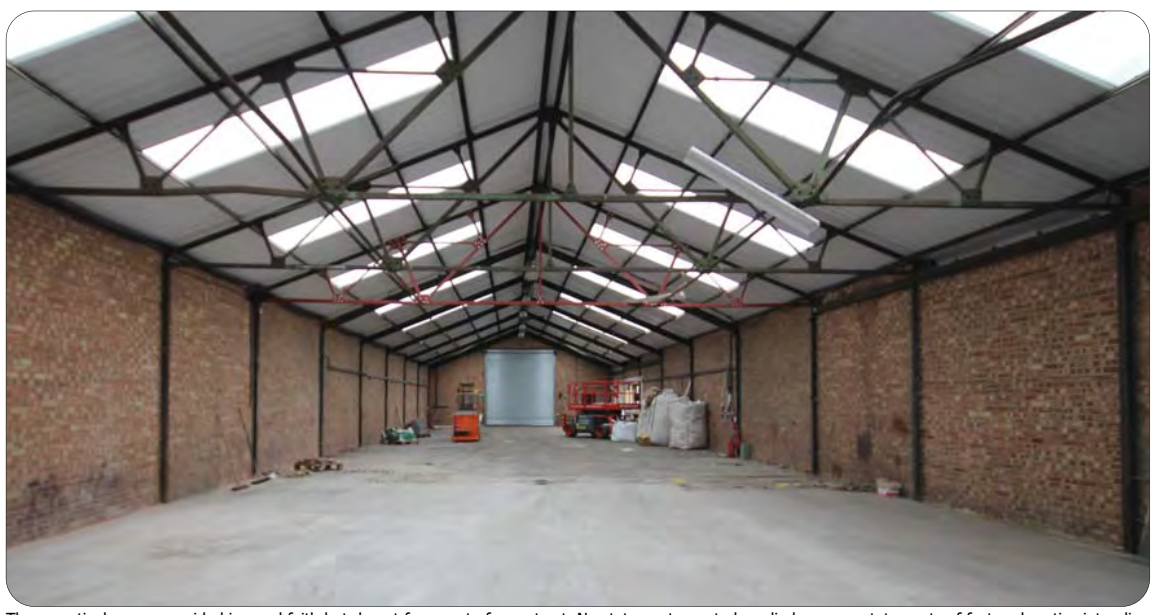
These particulars are provided in good faith but do not form part of a contract. No statements are to be relied upon as statements of fact and parties intending to rely upon the information for any purpose whatsoever must satisfy themselves by inspection or otherwise as to the correctness of each statement.