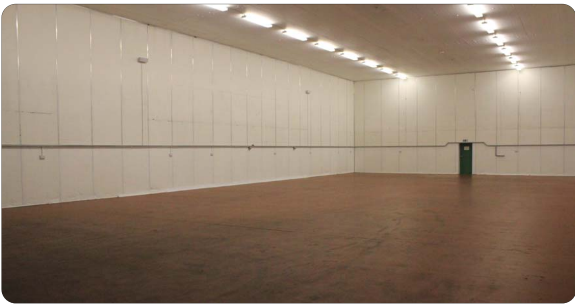
These particulars are provided in good faith but do not form part of a contract. No statements are to be relied upon as statements of fact and parties intending to rely upon the information for any purpose whatsoever must satisfy themselves by inspection or otherwise as to the correctness of each statement.