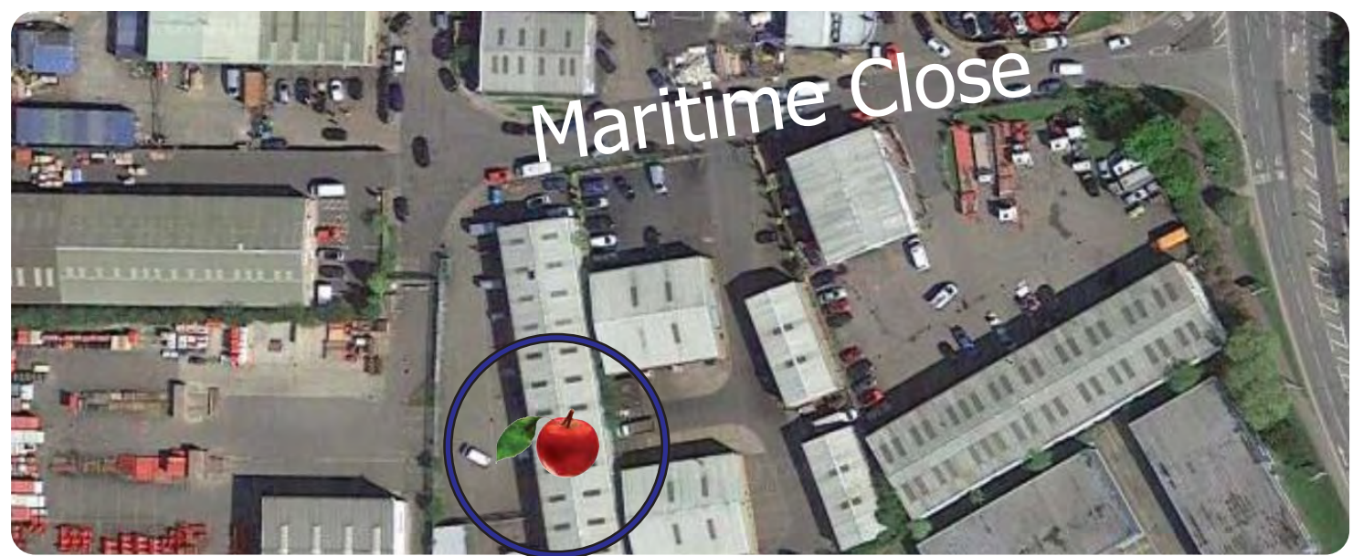
These particulars are provided in good faith but do not form part of a contract. No statements are to be relied upon as statements of fact and parties intending to rely upon the information for any purpose whatsoever must satisfy themselves by inspection or otherwise as to the correctness of each statement.