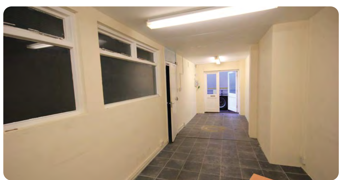
These particulars are provided in good faith but do not form part of a contract. No statements are to be relied upon as statements of fact and parties intending to rely upon the information for any purpose whatsoever must satisfy themselves by inspection or otherwise as to the correctness of each statement.