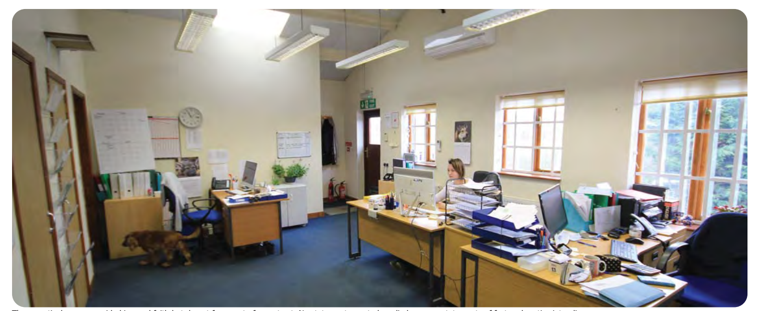
These particulars are provided in good faith but do not form part of a contract. No statements are to be relied upon as statements of fact and parties intending to rely upon the information for any purpose whatsoever must satisfy themselves by inspection or otherwise as to the correctness of each statement.