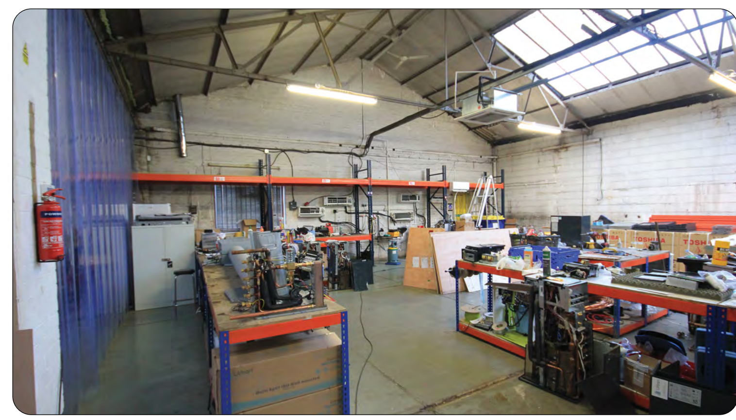
These particulars are provided in good faith but do not form part of a contract. No statements are to be relied upon as statements of fact and parties intending to rely upon the information for any purpose whatsoever must satisfy themselves by inspection or otherwise as to the correctness of each statement.