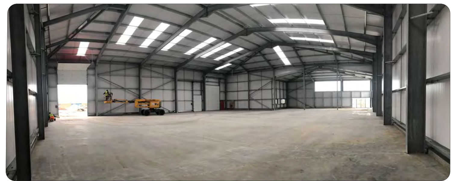
These particulars are provided in good faith but do not form part of a contract. No statements are to be relied upon as statements of fact and parties intending to rely upon the information for any purpose whatsoever must satisfy themselves by inspection or otherwise as to the correctness of each statement.