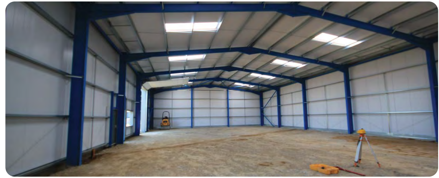
These particulars are provided in good faith but do not form part of a contract. No statements are to be relied upon as statements of fact and parties intending to rely upon the information for any purpose whatsoever must satisfy themselves by inspection or otherwise as to the correctness of each statement.