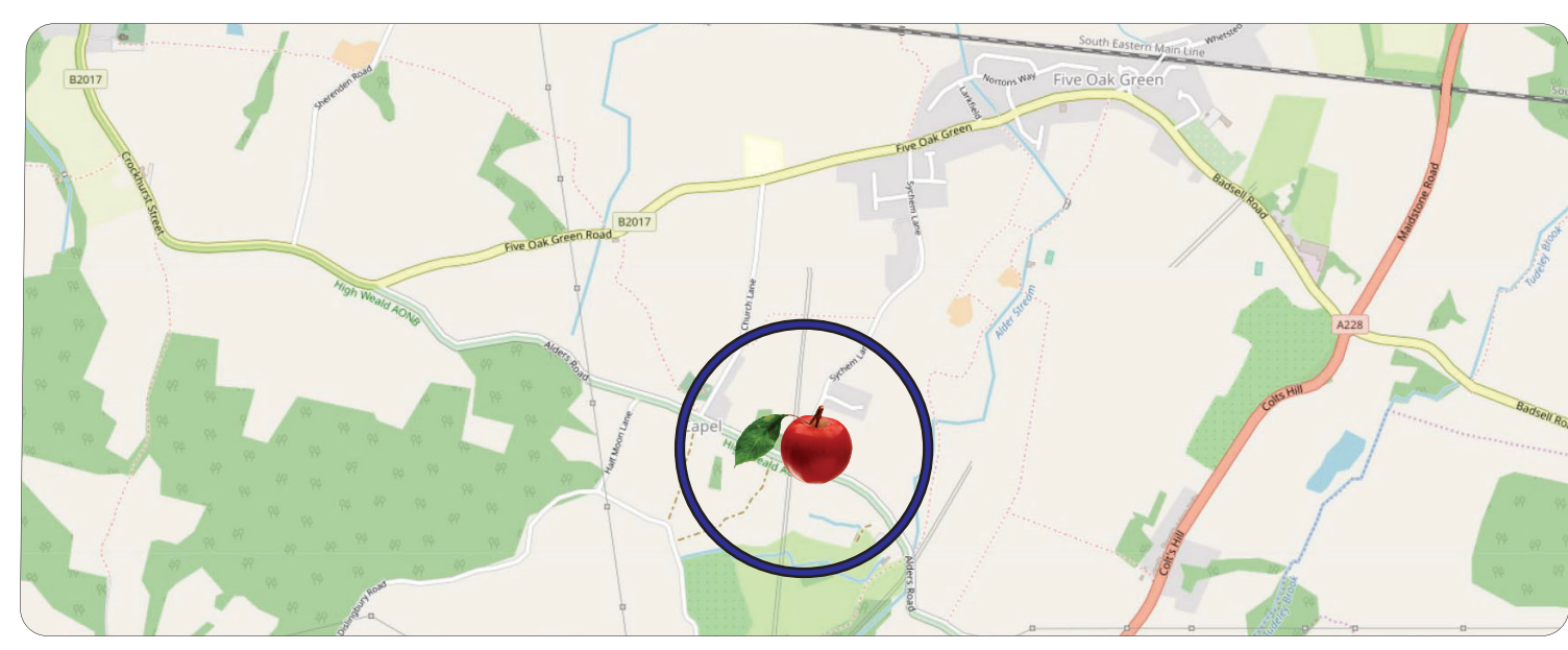
These particulars are provided in good faith but do not form part of a contract. No statements are to be relied upon as statements of fact and parties intending to rely upon the information for any purpose whatsoever must satisfy themselves by inspection or otherwise as to the correctness of each statement.