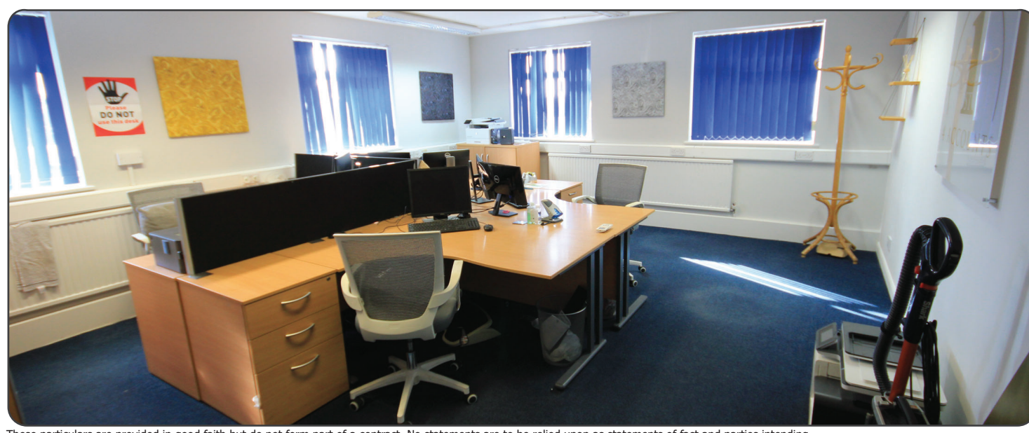
These particulars are provided in good faith but do not form part of a contract. No statements are to be relied upon as statements of fact and parties intending to rely upon the information for any purpose whatsoever must satisfy themselves by inspection or otherwise as to the correctness of each statement.