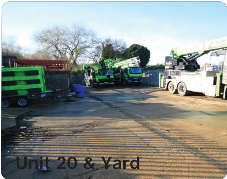
Unit 20 & Yard