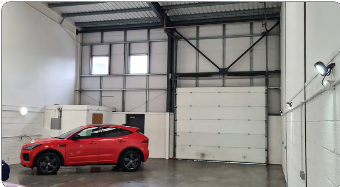
These particulars are provided in good faith but do not form part of a contract. No statements are to be relied upon as statements of fact and parties intending to rely upon the information for any purpose whatsoever must satisfy themselves by inspection or otherwise as to the correctness of each statement.