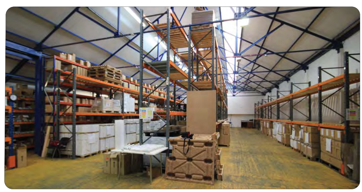
These particulars are provided in good faith but do not form part of a contract. No statements are to be relied upon as statements of fact and parties intending to rely upon the information for any purpose whatsoever must satisfy themselves by inspection or otherwise as to the correctness of each statement.